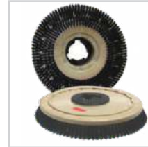
Grit Brush Strip/Scrub with Stiff Black 80 Grit Bristles #A0018 - 13" #A0038 - 15" #A0008 - 17" #A0009 - 20"