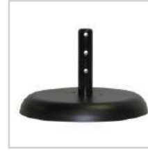
4.5" Weight Post Mount for Hexagonal Weights #HP-0008-45STAND (Use on 66 Frame Motors)