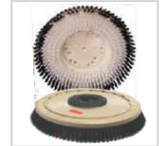
Nylon Carpet Brush Scrub with Soft & Stiff Nylon Bristle Mix #A0016 - 13" #A0037 - 15" #A0006 - 17" #A0007 - 20"