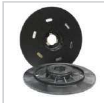
Premium Double Hook Pad Driver w/ Riser #A0017 - 13" #A0034 - 15" #A0010 - 17" #A0011 - 20"