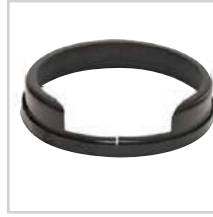
Splash Guard #SPLASH13 - 13" #SPLASH15 - 15" #SPLASH17 - 17" #SPLASH20 - 20"