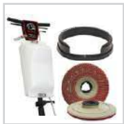
DX Package Includes Pad Driver, Solution Tank & Splash