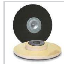
Premium Sandpaper Driver Plywood Block, Cushion Pad, 1" Riser #A0014-HD - 17" #A0014-1HD - 20"