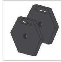
Hexagonal Weight for XHD 2-Speed Motor Mount #HPA0028-10P - 10 lbs. #HPA0028-25P - 25 lbs.