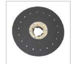
Diamond Pad Driver Plastic Block and Plate #A0017DPD - 13" #A0034 - 15" #A0010DPD - 17" #A0011DPD - 20"