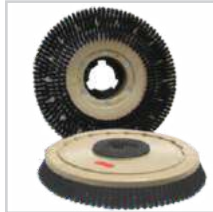
Stiff Poly Scrub Brush For General Scrubbing #A0020 - 13" #A0036 - 15" #A0002 - 17" #A0003 - 20"