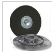
Economy Sandpaper Driver Molded Plastic Block, Cushion Pad, 1" Riser #A0014 - 17" #A0014-1 - 20"