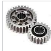
Steel Gears Muscle