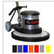
Private Label with 8 Stock Color Brush Covers