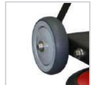
Easy Transport with 1"x5" Non-marking Ball-Bearing Wheels