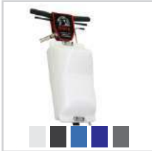
4.5 Gallon Solution Tank 5 Stock Colors 4 Special Order Colors #A0001-4-Color