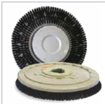
Hawk Spin Safe Carpet Brush w/Adjustable S/S Glide Plate Smooth Adjustable Plate Protects The Carpet #A0013-17 - 17" #A0013-20 - 20"