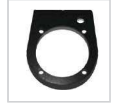
20# Frame Weight for XHD 2-Speed #HPA0032-2P