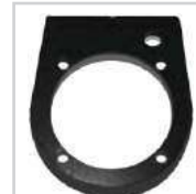
XHD Has Power & Gears for Add-on Weights