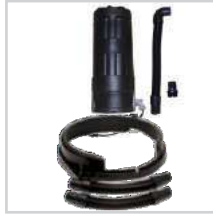
Vacuum Assembly Kit Dust Ring, Tank Vacuum & Hardware #TH1011-STD17 - 17" #TH1011-STD20 - 20"