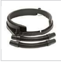
Dust Pickup Systems for 66 Frame Motors #HP0031-DC17-STANDKIT #HP0031-DC20-STANDKIT