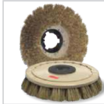
Tampico Polishing / Scrubbing Brush #A0021 - 13" #A0035 - 15" #A0004 - 17" #A0005 - 20"