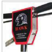
Hi/Lo Speed Motor Switch on Handle