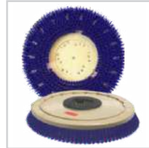
Lite Grit Brush Scrub with Flexible Blue 150 Grit Bristles #A0018-1 - 13" #A0038-1 - 15" #A0008-1 - 17" #A0009-1 - 20"